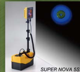
SUPER NOVA 5S