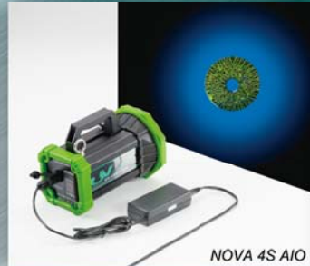
NOVA 4S AIO