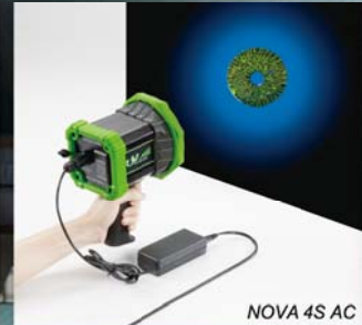
NOVA 4S AC